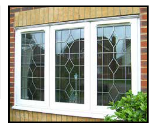
To create equal glass areas within the window design, it is necessary to introduce 'dummy sashes'.

Dummy sashes greatly assist when using decorative glass patterns.