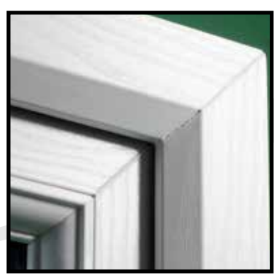
WHITE WOODGRAIN FINISH (INTERNAL VIEW)

U70 products have expanded the 'standard colour range' by introducing two foiled choices, a white woodgrain (internal/external) and a black on white woodgrain finish. Both finishes can be integrated to produce a 'mock Tudor' appearance whilst still maintaining a high quality grained surface internally. All of the foiled colour range meets with