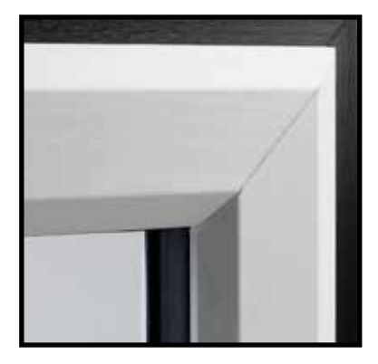
BLACK FOILED OUTER FRAME WITH WHITE FOILED SASH

current and future energy BFRC rating scheme - and in many instances exceeds the current standards!