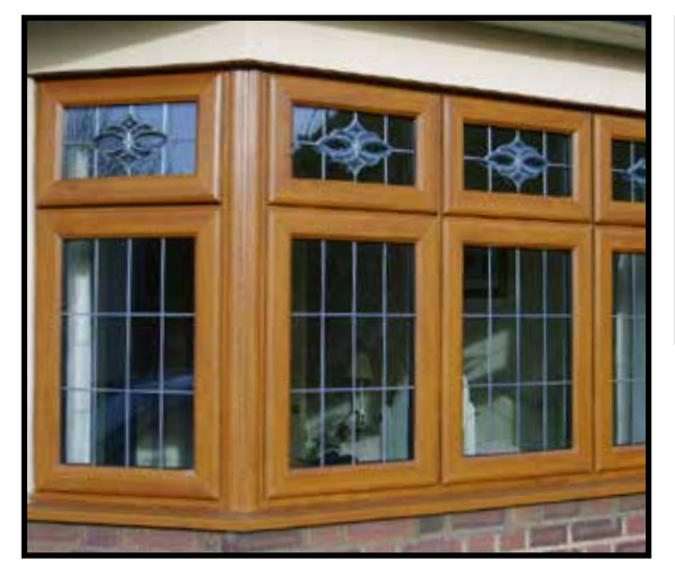
Enhance the appearance of your new frames by selecting a glass design from an extensive range of patterns & colours or simply match the existing character of your home by choosing from the literature shown on right.